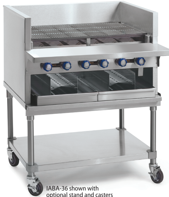
IABA-36 shown with optional stand and casters

Optional stainless steel, full width 9-3/4" (248 mm) work deck with cut-out for sauce pans.