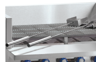
Optional log poker with shovel.