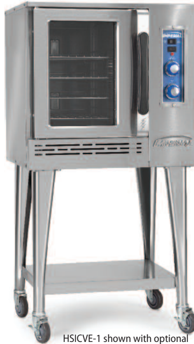
HSICVE-1 shown with optional bottom shelf and casters

Oven interior is porcelainized for easy cleaning.