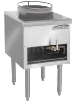
ISP-J-W13 Mandarin Wok Range