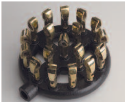
Anti-clogging jet burners produce a cone shaped intense flame.