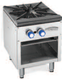
ISPA-18 Stock Pot Range