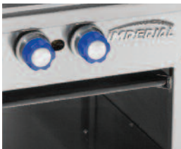
3-ring burner has 2 adjustable gas valves to control inner and outer rings.