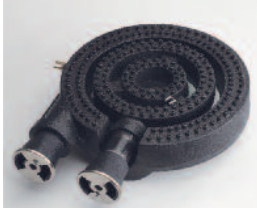
3-ring burner for high performance cooking.