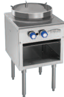
ISP-18-W Tempura Wok Range