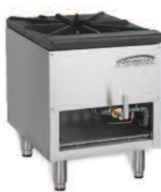
ISP-J-SP Hi-Temp Stock Pot Range